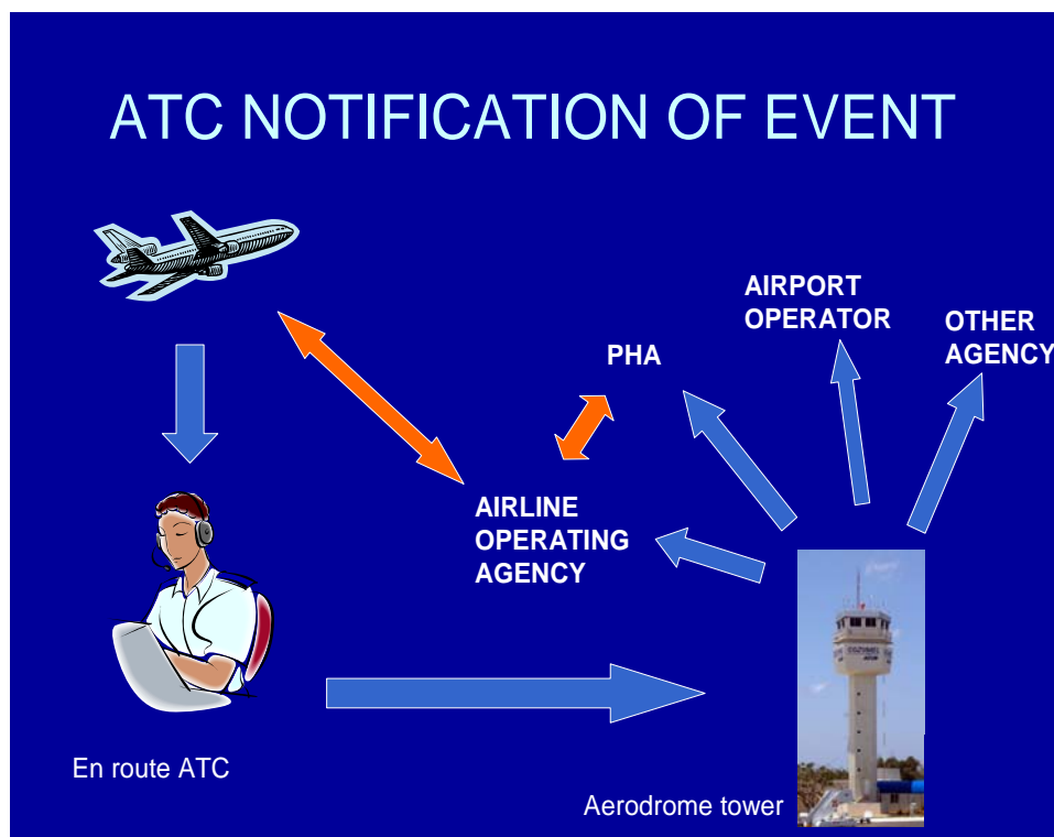
Figure 1 Air traffic control (ATC) notification of an event

He/she shall inform air traffic control, as early as possible before arrival, of any cases of illness indicative of a disease of an infectious nature or evidence of a public health risk on board. This information must be relayed immediately/as soon as possible by air traffic control to the competent authority for the destination airport, according to procedures established in IHR (2005), Article 28.4 and ICAO Procedures for Air Navigation Services – Air Traffic Management (PANS-ATM, Document ICAO PANS-ATM 16.6), as described in Figure 1 and in Box 3.